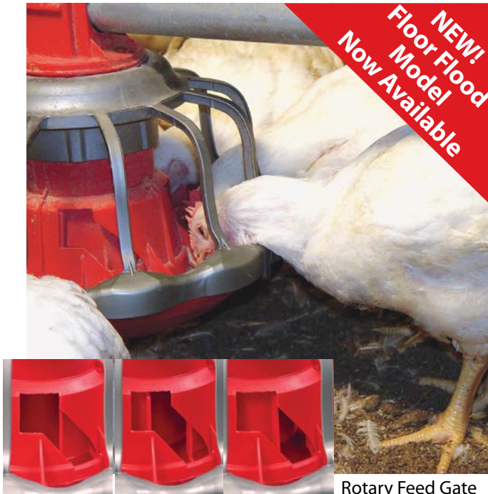
Rotary Feed Gate

Chore-Time's complete broiler feeding systems provide innovative design, proven performance and durability.